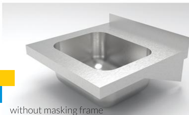
without masking frame