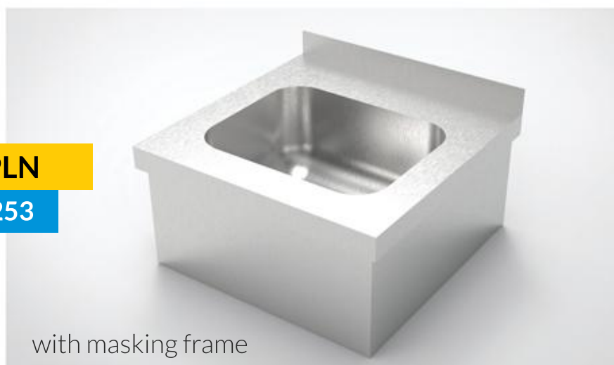
with masking frame